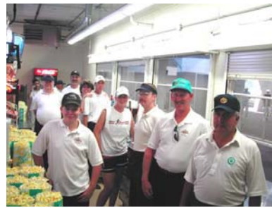
Glastonbury and Rocky Hill Councils unify to share the work and the profits